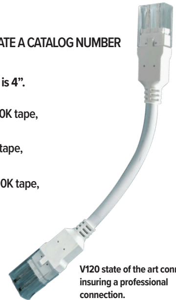
V120 state of the art connectors insuring a professional connection.

Example: To order a 95'-8" length of 4000K tape, specify: V120-HO-40-95-8