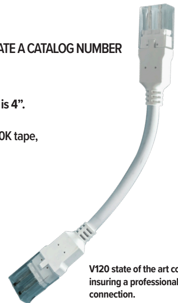
V120 state of the art connectors insuring a professional connection.

Example: To order an 8'-4" length of 2700K tape, specify: V120-SO-27-8-4