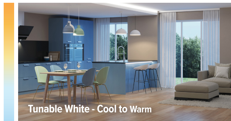
Tunable White - Cool to Warm