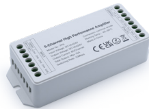
5 Channel Repeater RPT-RGBTW