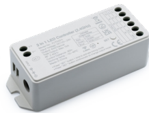
Remote* and Controller HCCM-RF-RGBTW