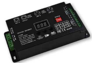
5-Channel DMX Decoder DMX-LT-995