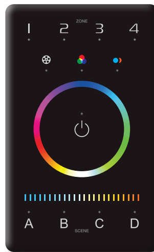
DMX Wall Controller with Bluetooth App WC5-RGBTW-DMX-BT