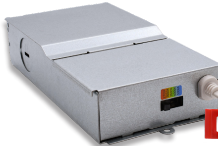
Power supply with integrated junction box